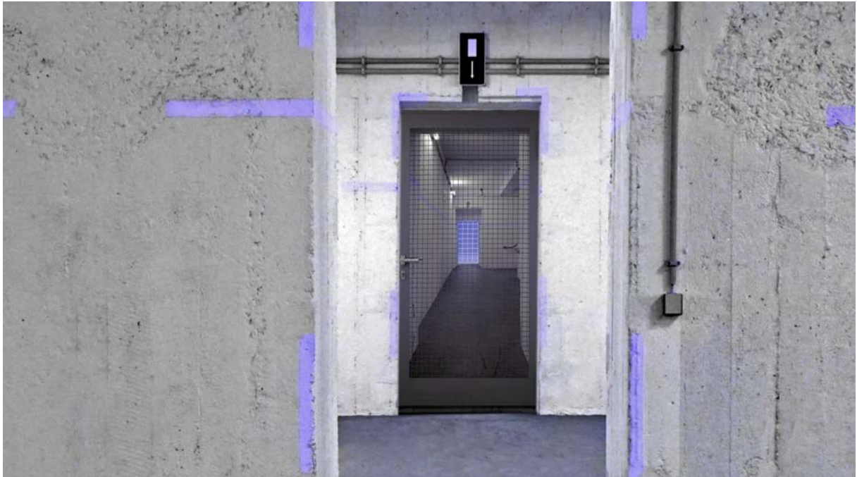
Monika Oechsler, Sometimes I Dream , video still, 2021. Beaconsfield online

info@beaconsfield.ltd.uk www.beaconsfield.ltd.uk