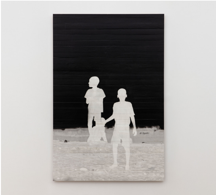
JR, Les Enfants d'Ouranos , 2022. Ink on wood. Overall: 299.7 × 199.4 cm | 118 × 78 1/2 in. Each panel (x3): 101.6 × 199.4 cm | 40 × 78 1/2 in. Photo: Guillaume Ziccarelli. ©JR. Courtesy of the artist and Perrotin.