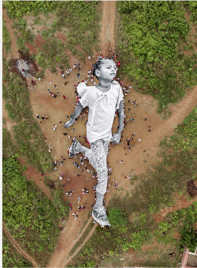
JR, Déplacé-e-s, Andiara, Colombia, 2022 . Marouflage of a photo print on a cotton canvas, stretched on an aluminium back frame, light oakframe. 160 × 120 cm | 63 × 47 1/4 in.