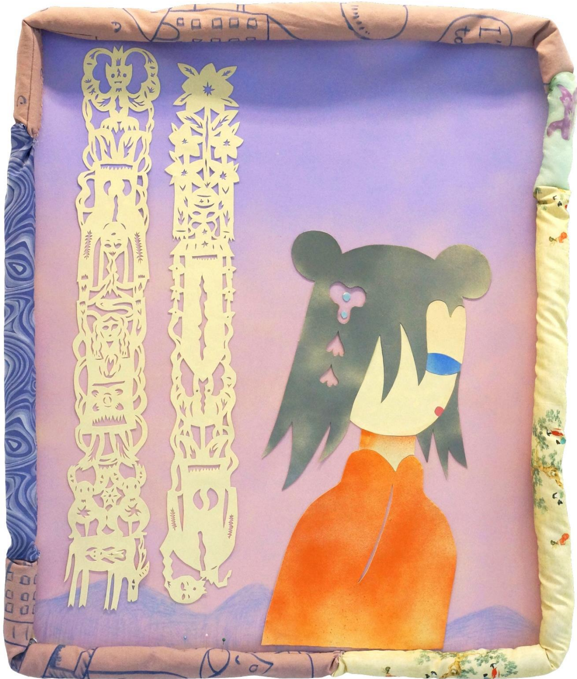
Castle in the Air by Mengwei Chen