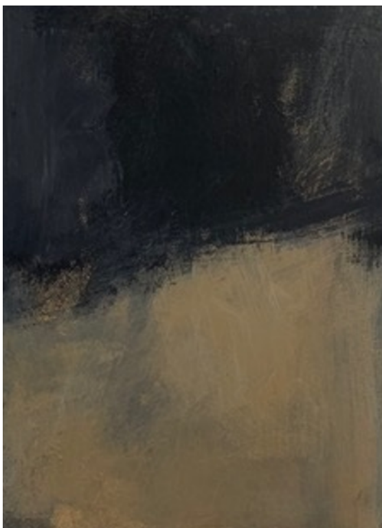
Isabella Dyson Suffolk Cornfield at Night 2024