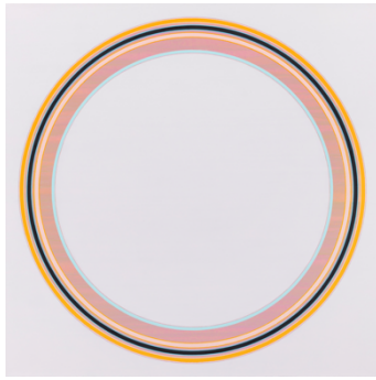
Carol Robertson Phases #4 2020

Saturday 2 November - Sunday 8 December 2024 open Saturdays + Sundays only, 12 noon – 5pm or by appointment 07910359087