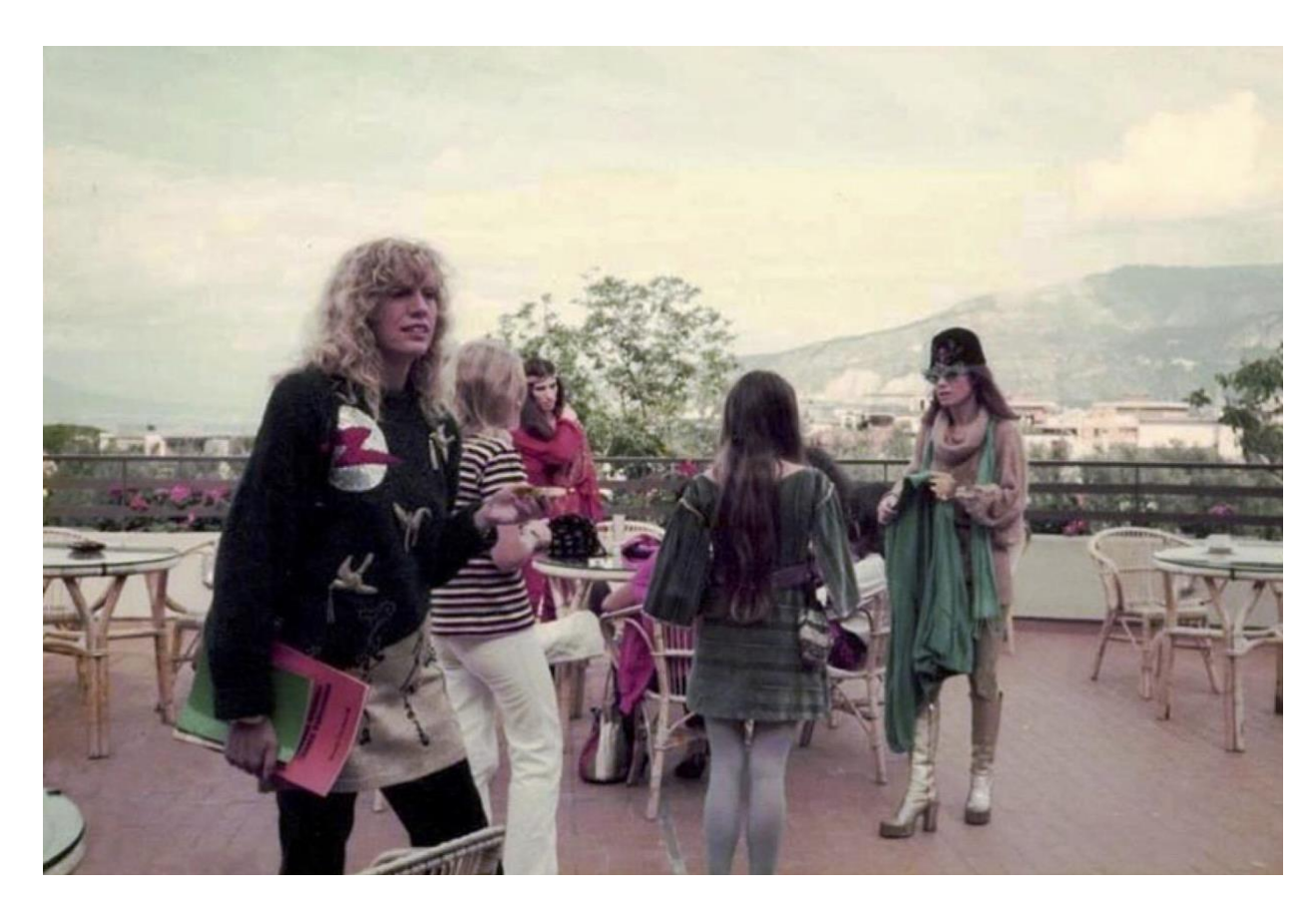
'Rassegna del Cinema Femminista' organised by Le Nemesiache, Sorrento 1984, original photograph from the feminist film festival, photographer unknown. Courtesy of Le Nemesiache's archive.

'WE DENOUNCE the violence which deprived ourselves of our bodies, of our expressions and of our extensions. CREATIVITY IS POLITICAL, it is life, routine, erotics, in harmony with nature and the cosmos' — Le Nemesiache, 1977.