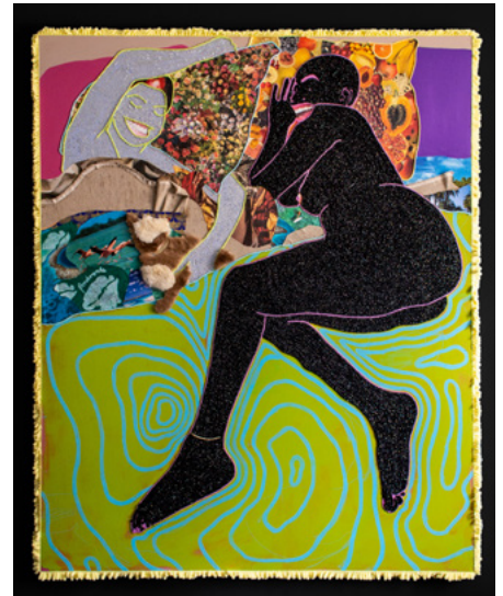
KEEYA: Family Portrait (2022)

Curated by artist Andrew Salgado, the LGBTQ+ themed exhibition Come Out & Play celebrates internationally-based queer artists whose practice prioritizes a bold approach and work that is celebratory, challenging, and progressive. The artists included present queerness as manifest through colour and play, a subject matter free from taboo or shame, and a greater practice that responds to the contemporary ideology of what it means to be a queer artist in society. Included works are primarily in – but not limited to – the form of figurative painting. The exhibition presents lesser-known LGBTQ+ artists alongside mid-career or more established artists at work today.