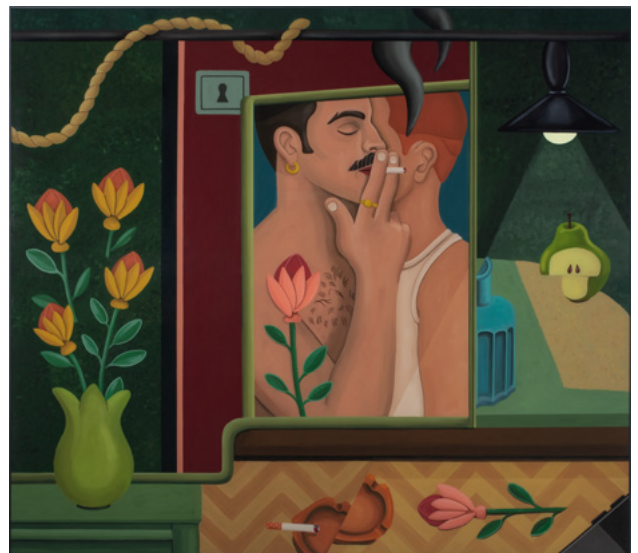
Gori Mora: Study of a living room (2022)