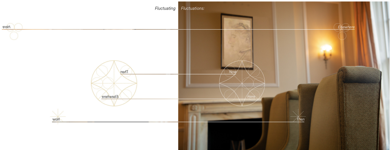
"Being in Absence"(2022), Sound installation

Event booking information: Free. Booking online is essential.