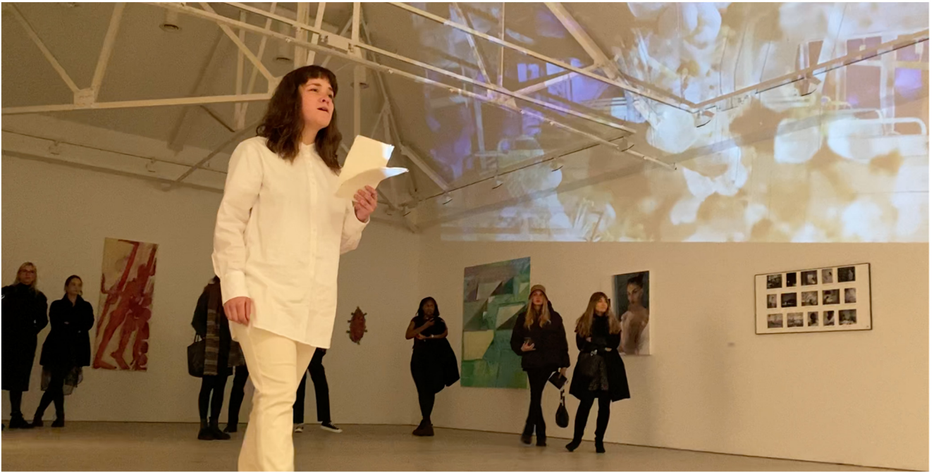
Performance at London Grads Now. 21/Saatchi LATES

This work is formulated as a performance ceremony to appreciate and visualize the memory of a dead star; phenomenon of gravitational waves. The performance is structured by reading performance with 2 performers and image projection. Anthropomorphizing the memory of a dead star, the gravitational waves that reach the earth in the sublime flow of a temporal axis combine with a first-person narrative to express the macro and infinite phenomenon of the universe as a private, intimate existence of the self generating subtle but powerful emotions.